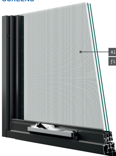
Aluminium screen fixed internally.