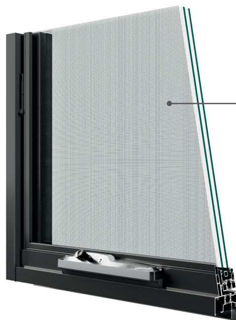
Aluminium screen fixed internally, with cam catches.