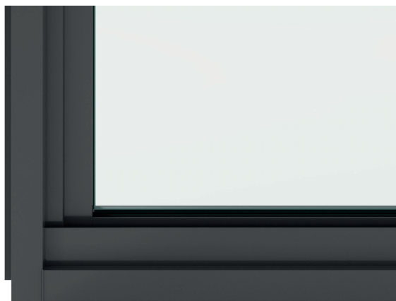
Bold modern frame

For full range of configurations and standard sizes refer to the standard size and range charts.