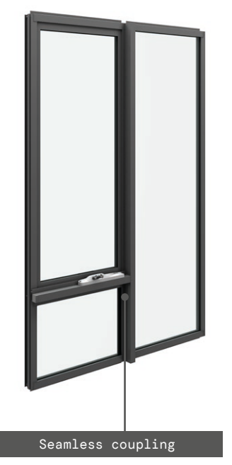
Compatible with other windows for design flexibility.

For full range of configurations and standard sizes refer to the standard size and range charts.